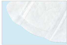
Show on Sanitary Pads